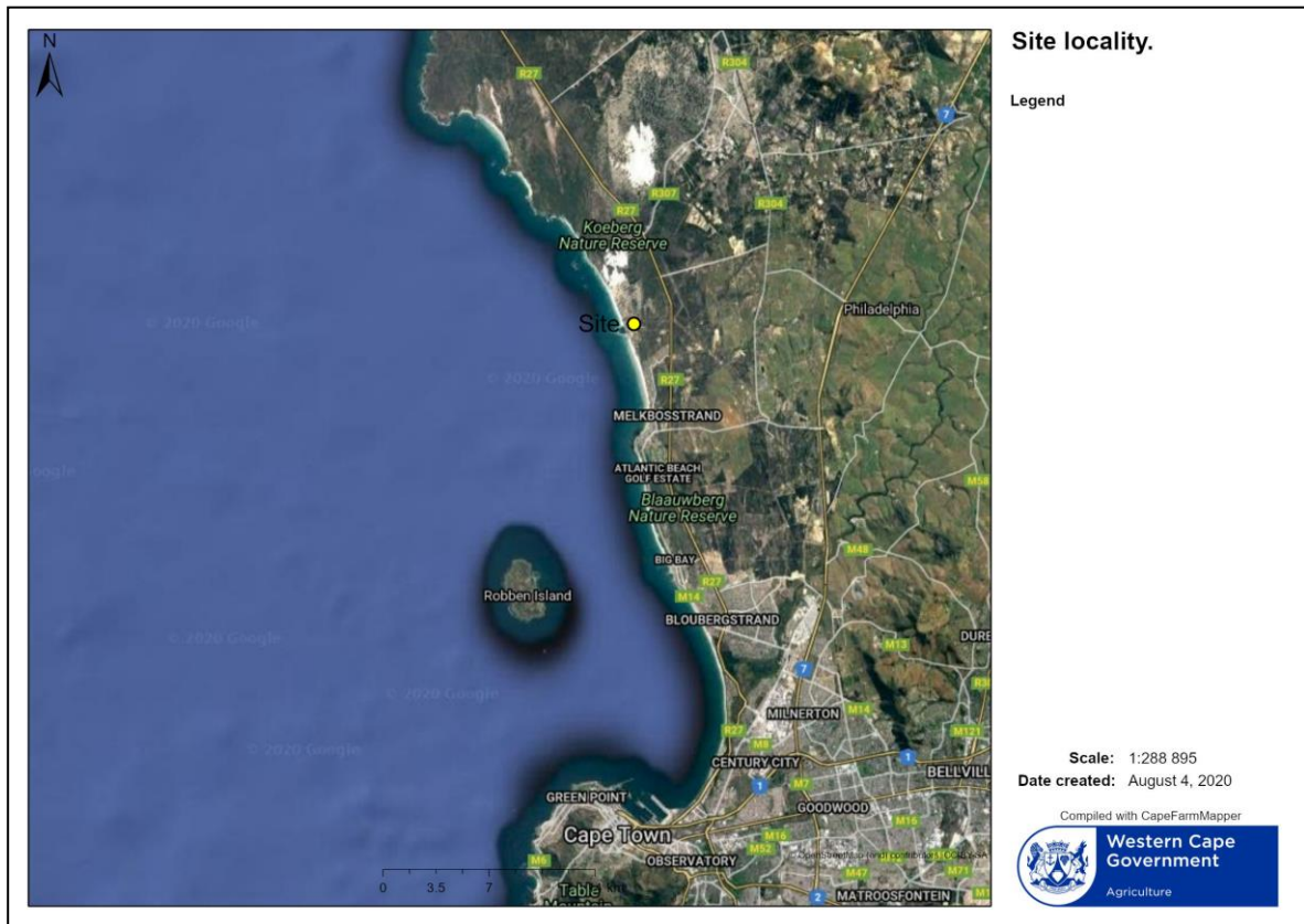
Figure 1: Locality of Koeberg Nuclear Power Station (site).