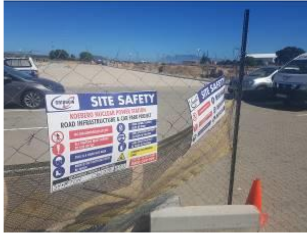
Image 14: Site notice notifying public and KNPS employees of the presence of a construction site.