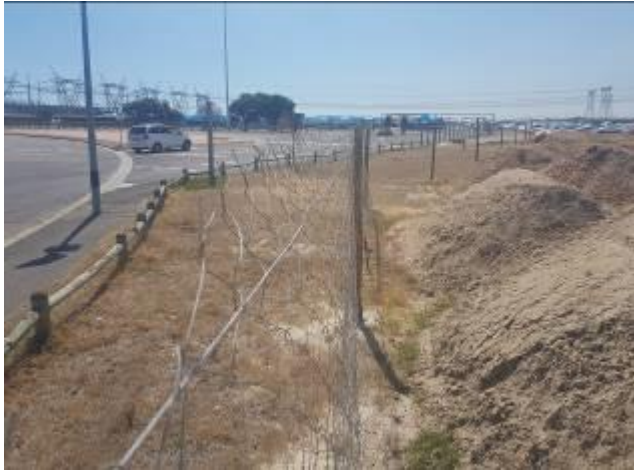
Image 24: Boundary fence preventing unnecessary clearance of vegetation.